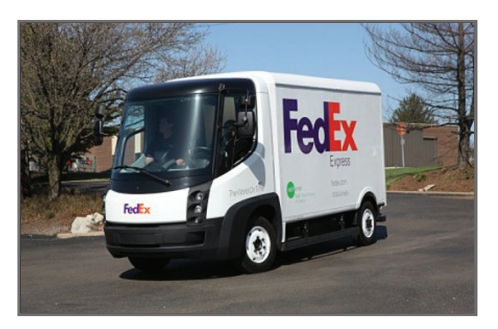
PHEV and EV Commercial Vehicles