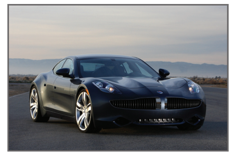
PHEV and EV Passenger Vehicles